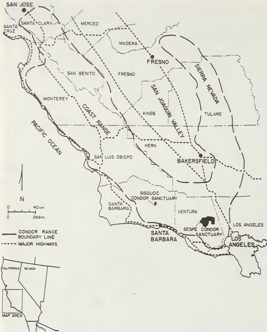
Fig. 3. Principal range of the California condor, 1966-1976.